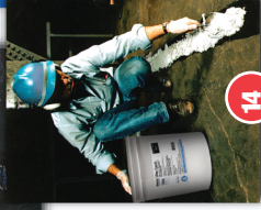
14 Floor Repair