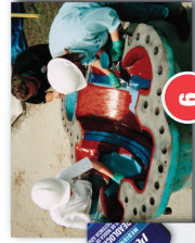
6 Metal Repair